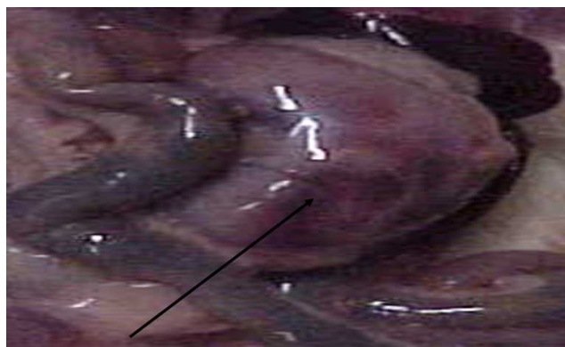
Figure 3. Arrow showing gastric ulceration from chemical burns following 50 mg/kg oral capsaicin.